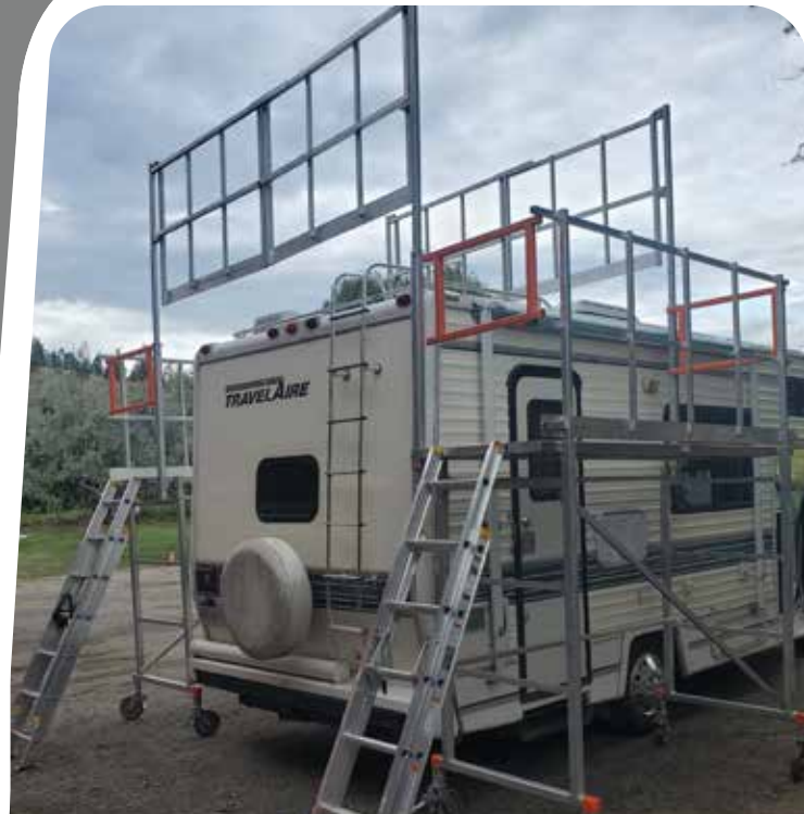
TWO ADJUSTABLE TYPE 1 LADDERS INCLUDED

FIXED OR ADJUSTABLE 6' 6" TO 9' HEIGHT SYSTEMS - 6" HEIGHT ADJUSTMENT SECTIONS