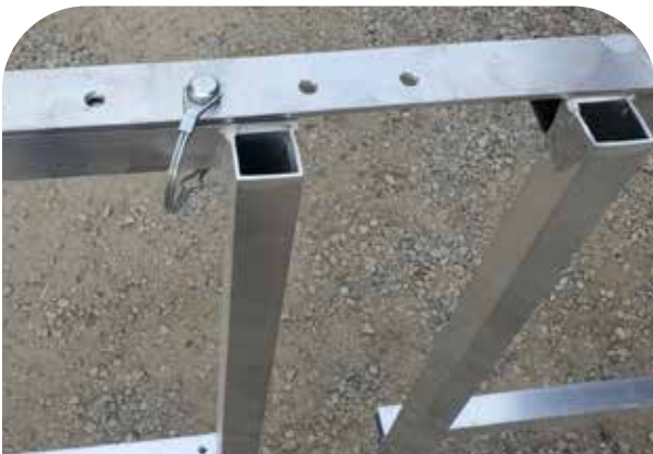
ROOF TOP HANDRAIL CONNECTION

ROOFTOP HANDRAILS CONNECT AT CENTER WITH LOCKING PIN