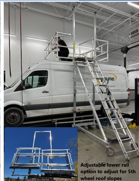
Adjustable lower rail option to adjust for 5th wheel roof slopes

Deck Access YouTube video link on our website 10' x 30" deck alongside 120" x 102" surround rail Class C, Transit Bus Sidewall access to 12' 8" max PRCSD128 Call for pricing Class C & A, 5th Wheel Sidewall access to 13' 8" max PRCSD14