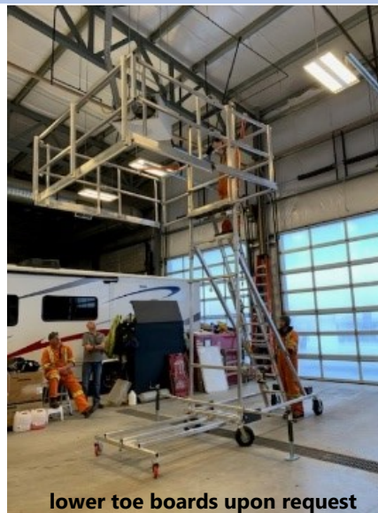
lower toe boards upon request